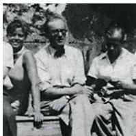
Le Corbusier, Pierre Jeanneret, Charlotte Perriand

In 1922, Le Corbusier began working in the new rue de Sèvres, Paris, atelier with his cousin Pierre Jeanneret with whom he shared research projects and design criteria in a profound and life-long professional relationship.