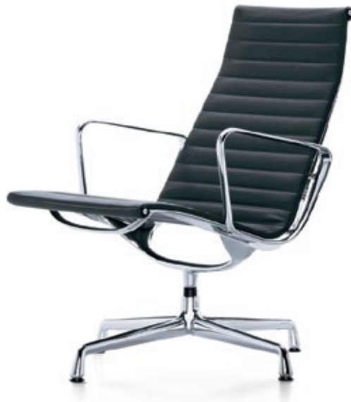
EA 116 /EA 115

The chairs in the Aluminium Group are the best known design by Charles and Ray Eames. The chairs were created in 1958 and are now a classic in the history of 20th century design.