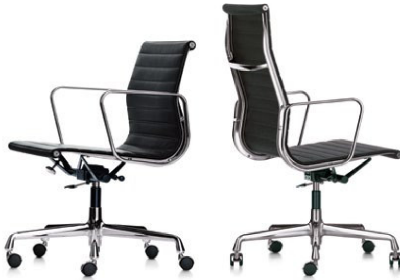
EA 117, EA 119

The chairs in the Aluminium Group are the best known design by Charles and Ray Eames. The chairs were created in 1958 and are now a classic in the history of 20th century design.