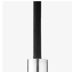
Clear glass and black fabric cord