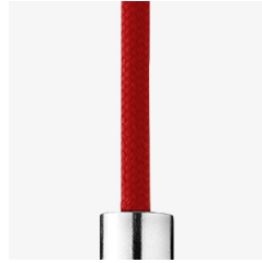
Clear glass and red fabric cord