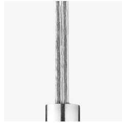
Clear glass and clear PVC cord