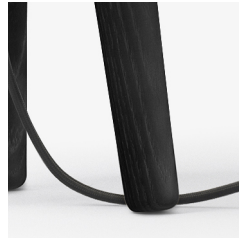
Black stained ash and black fabric cord