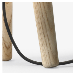
Untreated ash and black fabric cord