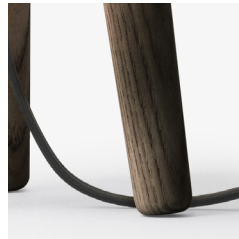
Smoked oiled ash and black fabric cord