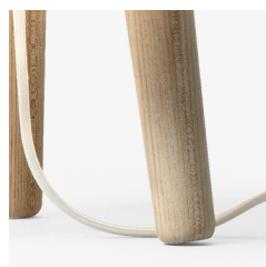
Untreated ash and white fabric cord