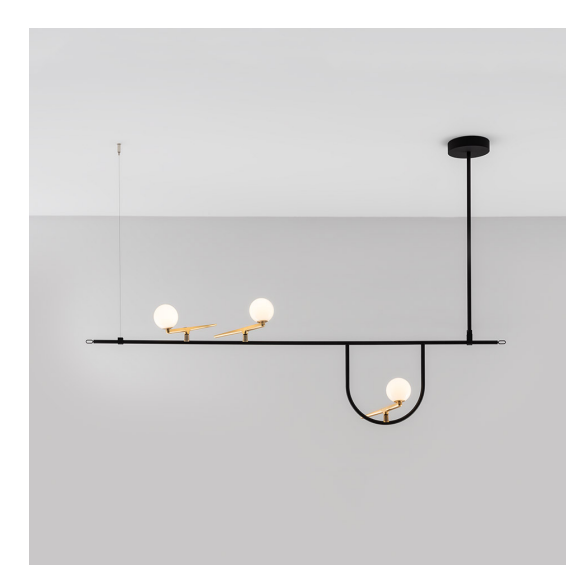
IP 20 (€ Dimmerable: +0 -