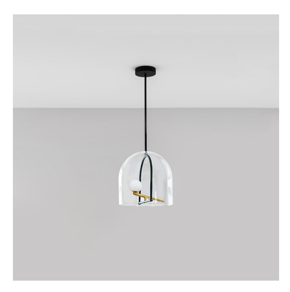
IP20 😩 🌃 🕻 E Dimmerable: +0-