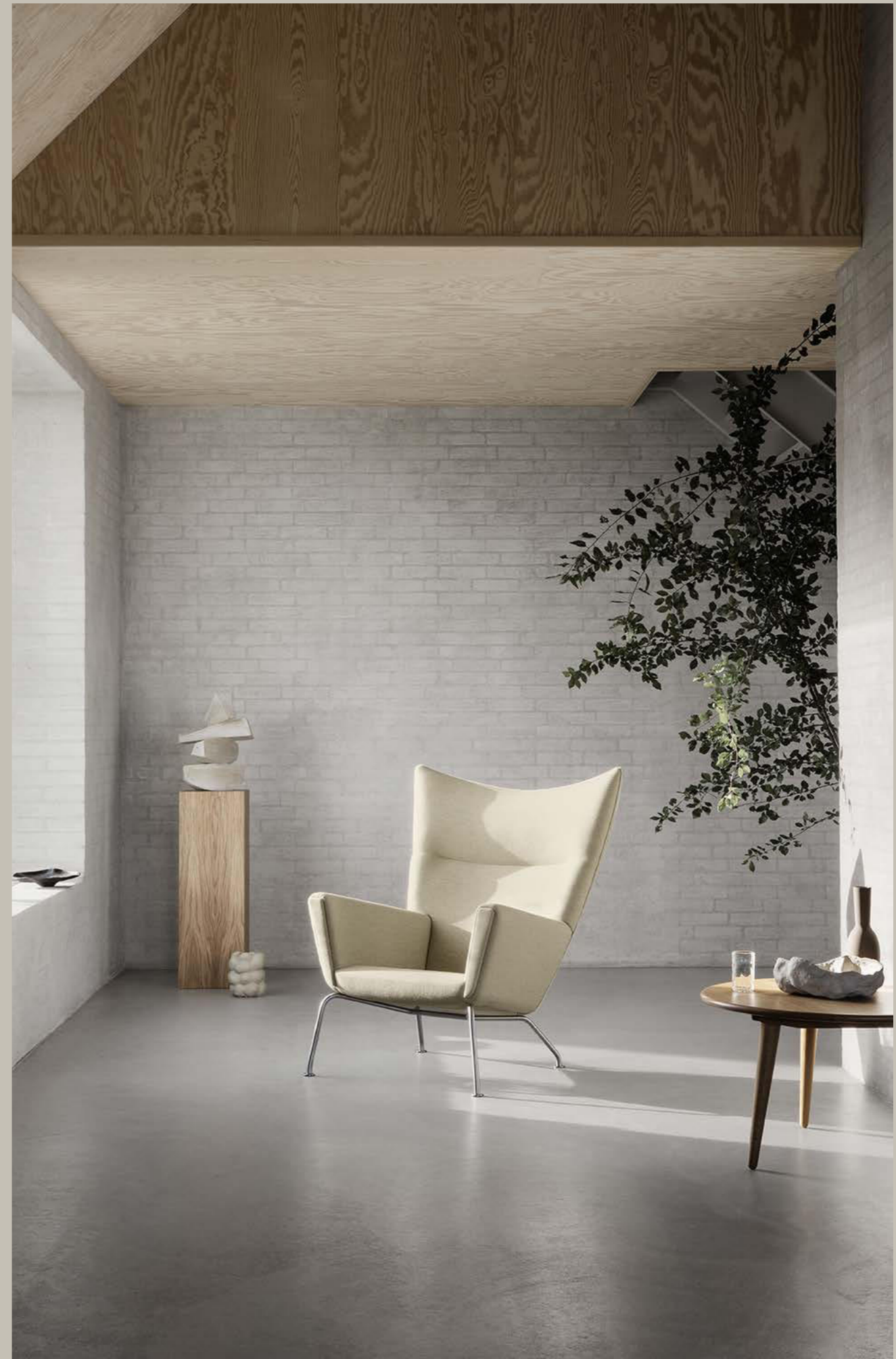
CH445 WING CHAIR

The CH445 Wing Chair & CH446 Footstool by Hans J. Wegner are offered in a new color palette in the upholstery 'Mode' by Maharam. Five new color variants are exclusively introduced for selected Carl Hansen & Søn dealers.