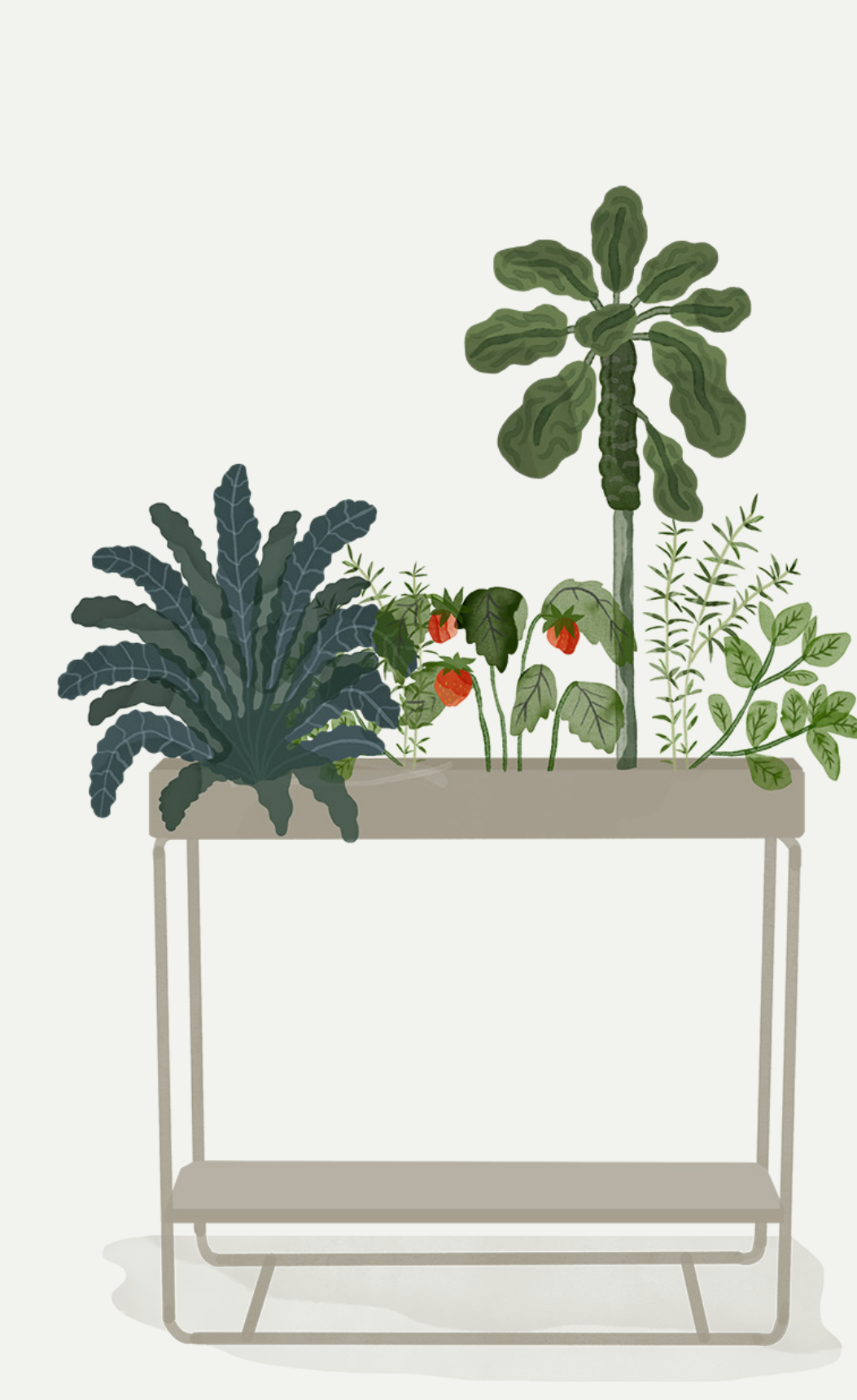
PLANT BOX - TWO TIER

We've made up a little guide with some suggestions as to how to furnish the different models of the Plant Box with some of our favourite flora. With the right amount of love and care, they will reward you with beautiful colours, scents and in some cases, edible treats.