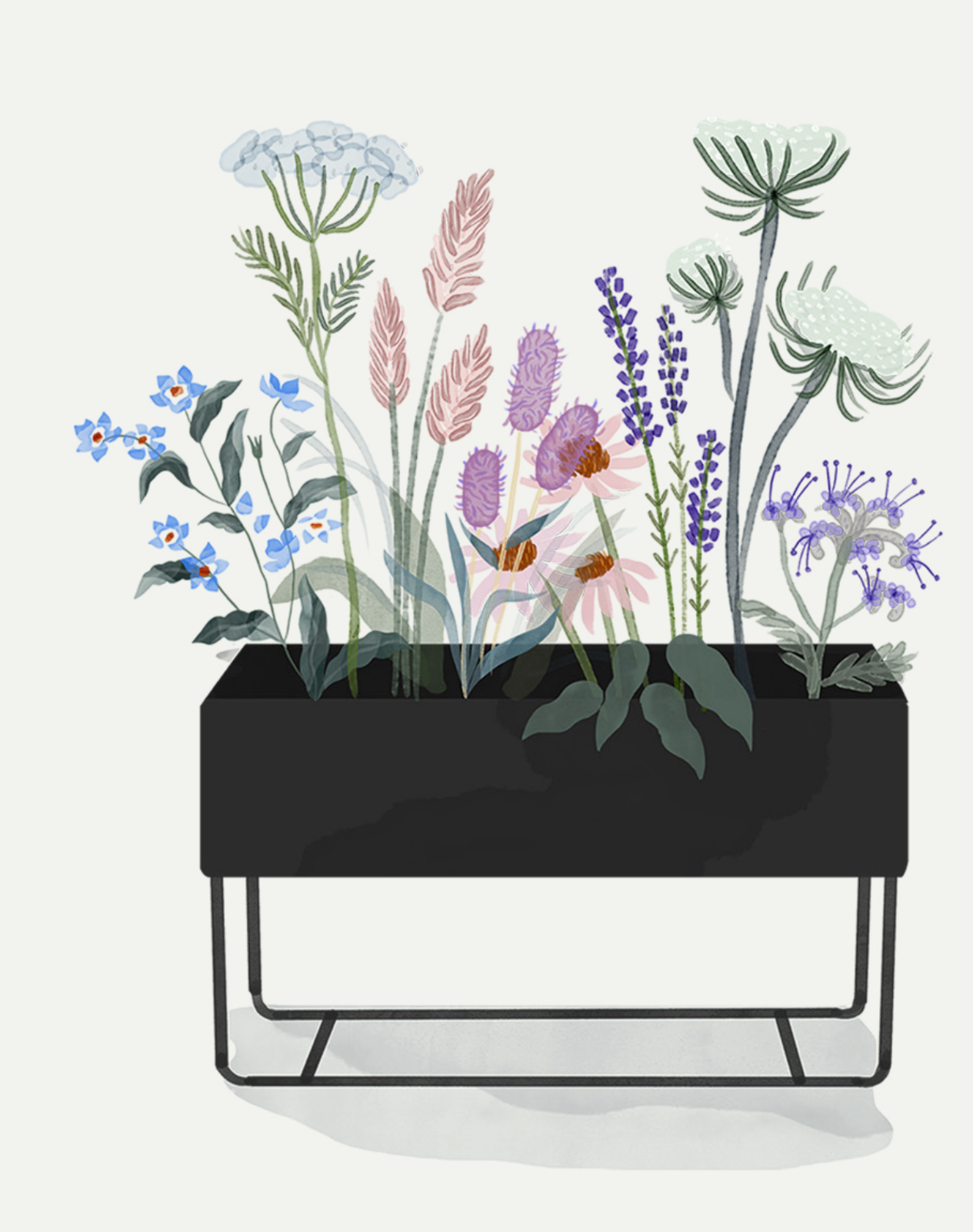
PLANT BOX - LARGE

We've all been there: excitement about the wildflower bouquet we've brought home from a day out in the forest quickly turns into disappointment as the flowers turn limp and withered – often only within minutes of being separated from the comfort of the soil. Why not just grow them yourself from the comfort of your own home? A great alternative to turning your backyard into a meadow is to use the Plant Box Large. With its low and deep dimensions, this Plant Box has ample room for wildflowers to put roots down, and will bring the wonderful, free feeling of the forest into your home.