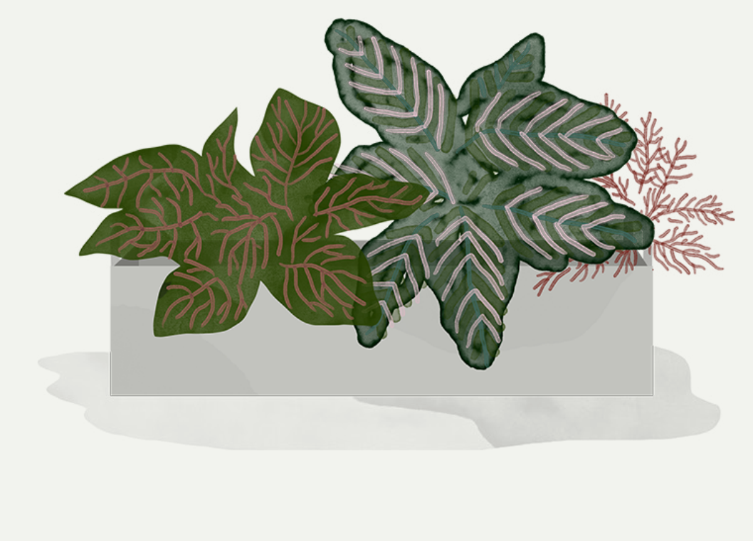
PLANT BOX - SMALL