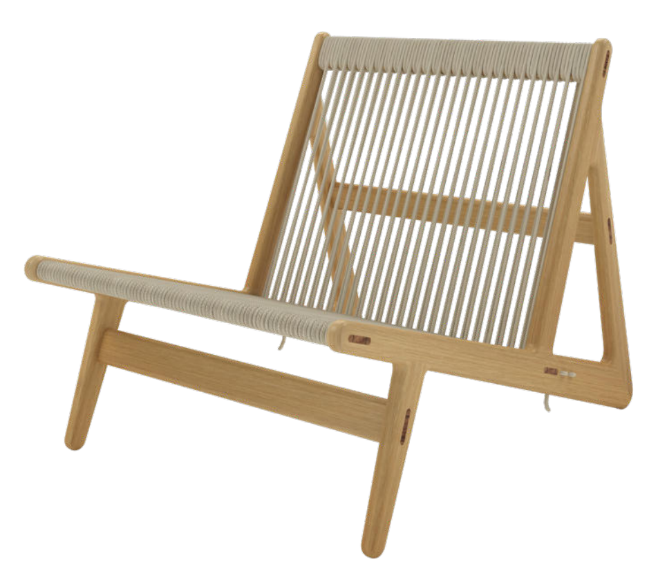
FSC-certified oak finished with oil

Natural linen with semi-elastic anti-deformation core