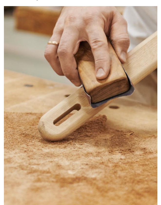
Honesty in materials