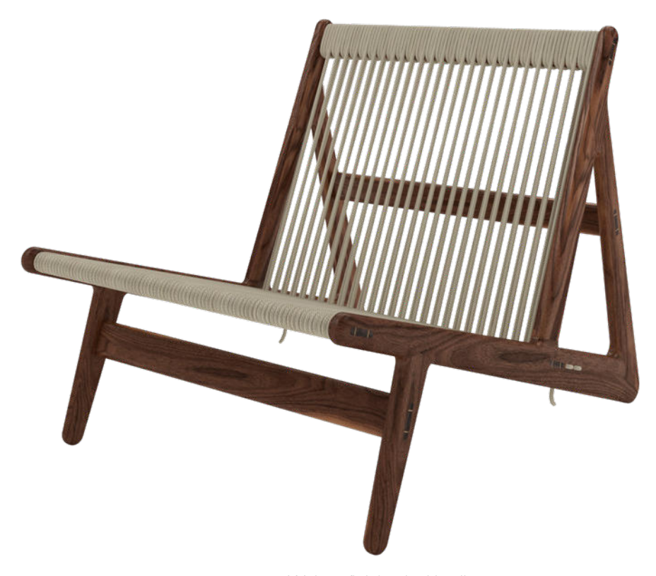
Walnut finished with oil

Natural linen with semi-elastic anti-deformation core