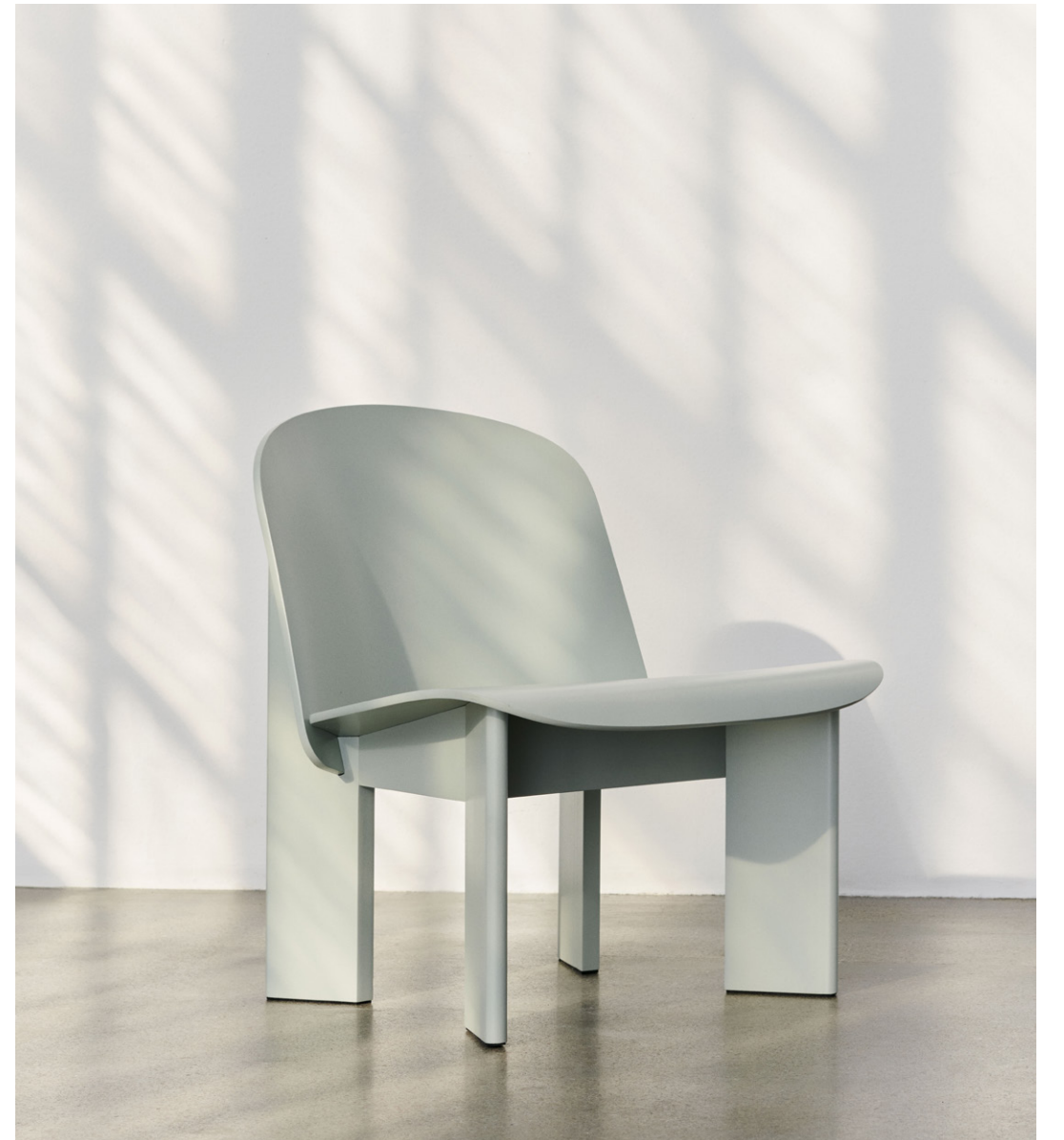
Chisel Lounge Chair | Eucalyptus water-based lacquered beech