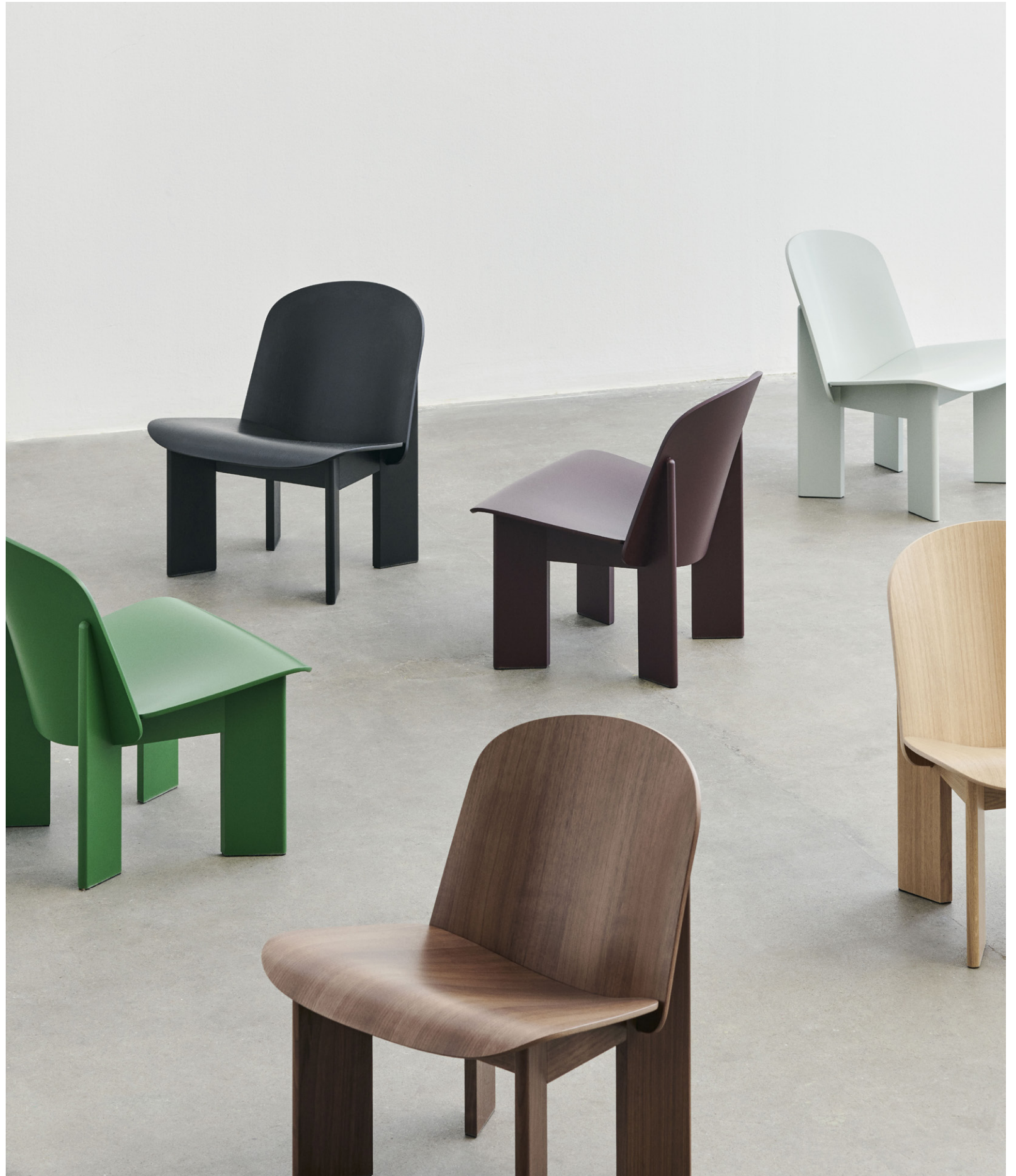
Chisel Lounge Chair Family