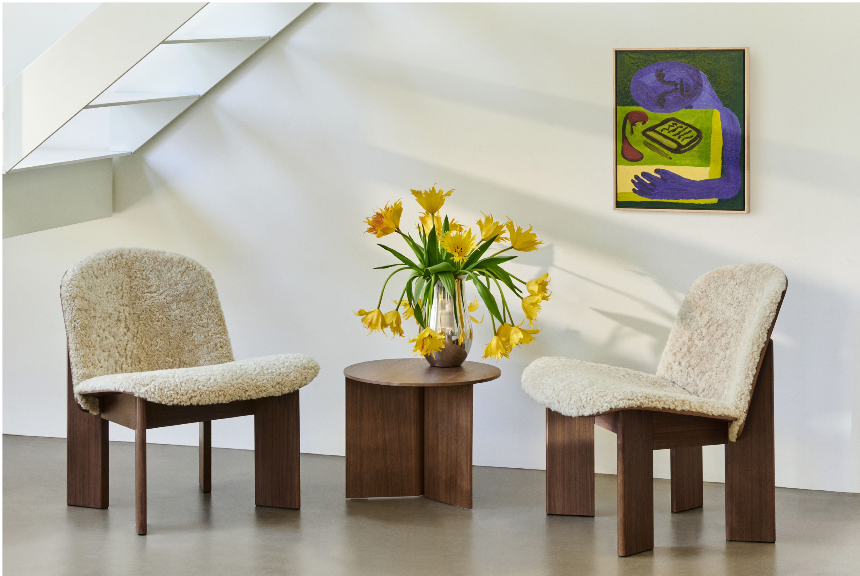
Chisel Lounge Chair | Sheepskin Mohawi 21 | Water-based lacquered walnut