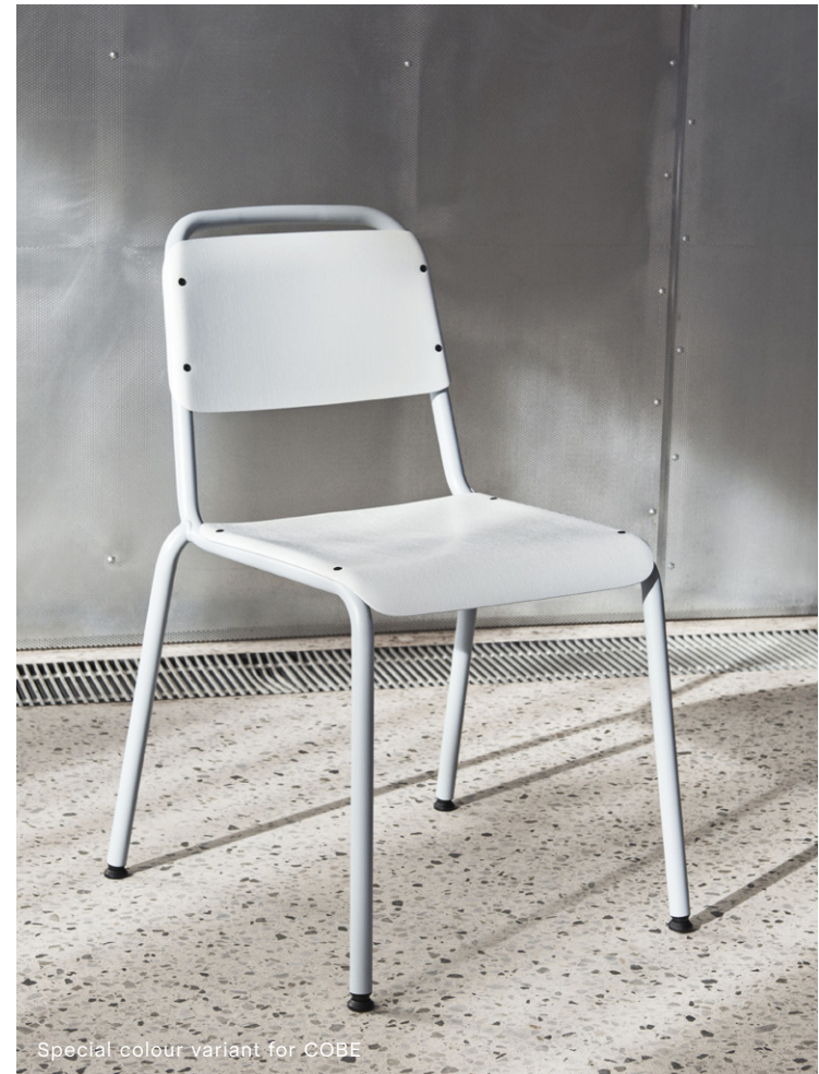
Special colour variant for COBE