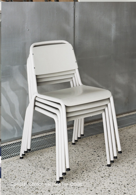
Special colour variant for COBE