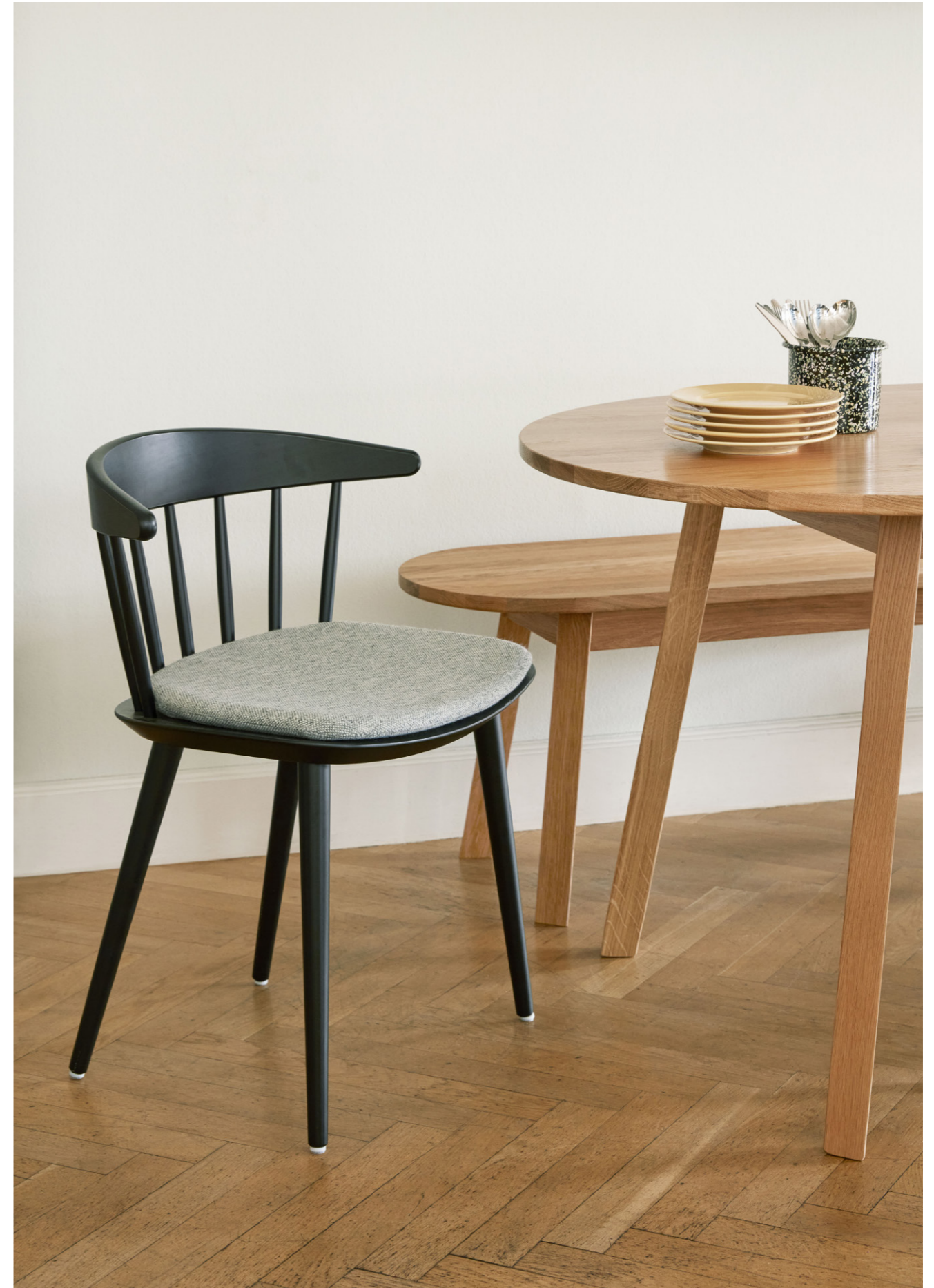
J104 Chair | Black water-based lacquered beech