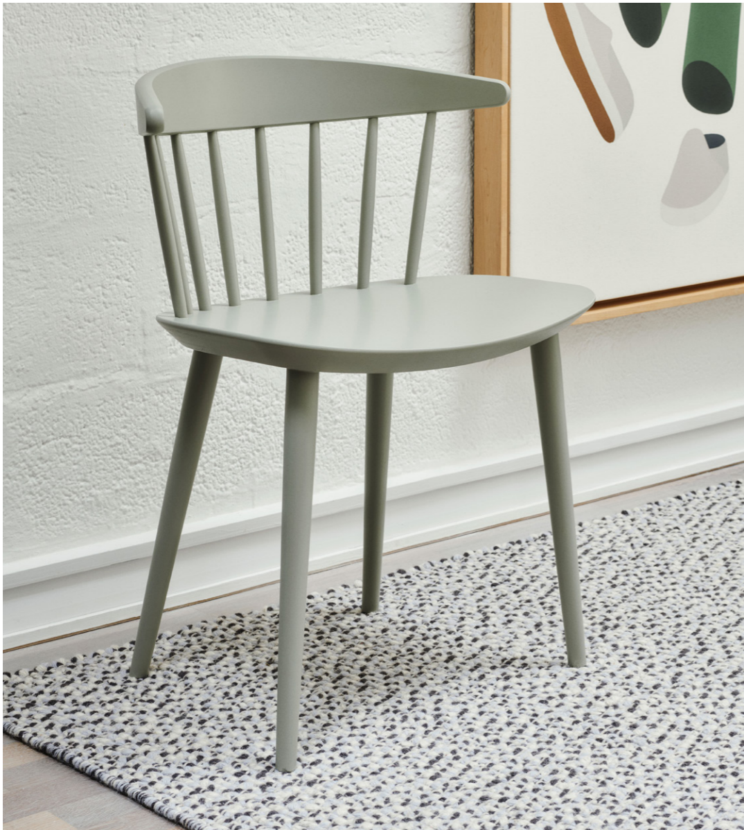
J104 Chair | Warm grey water-based lacquered beech