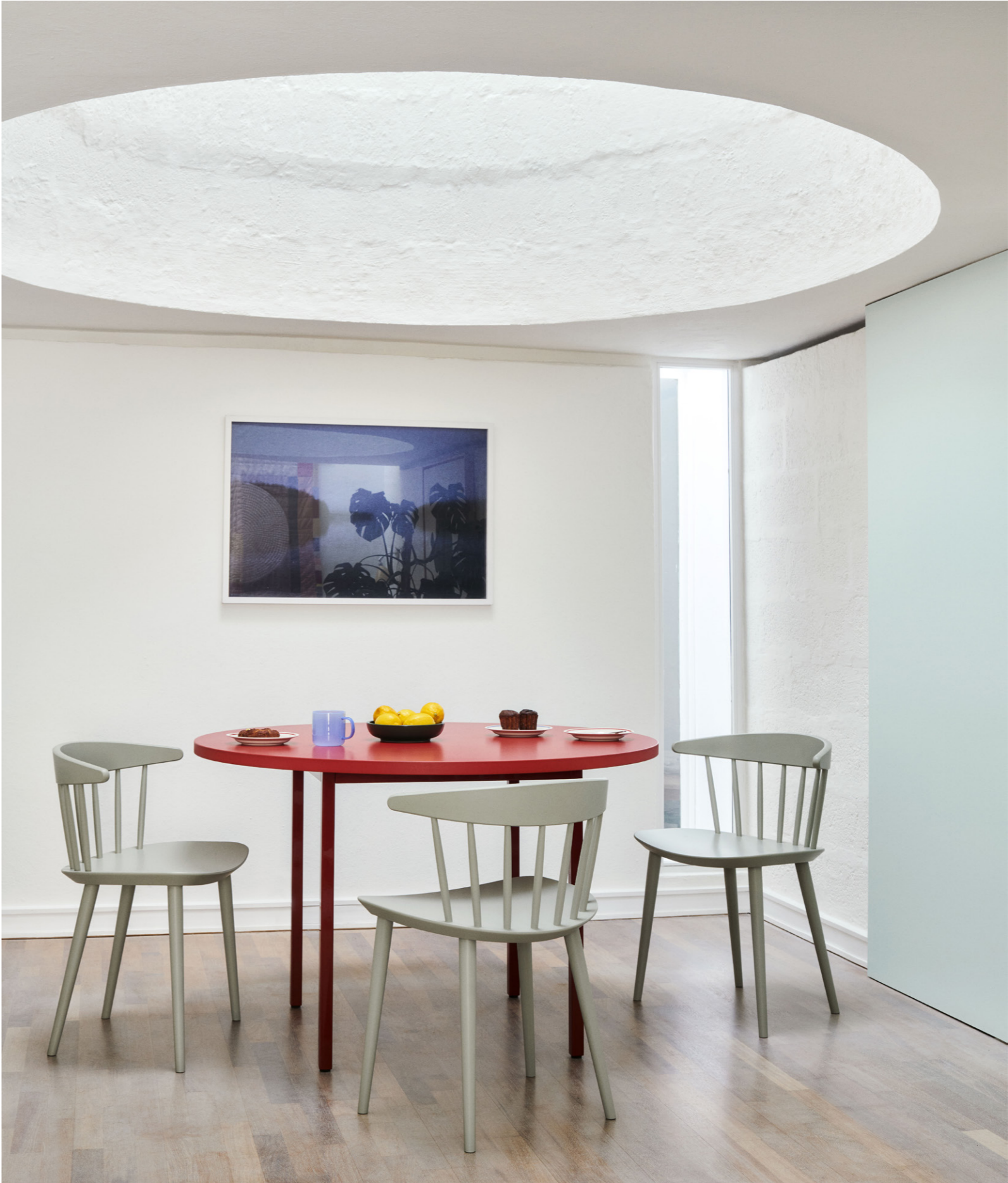
J104 Chair | Warm grey water-based lacquered beech