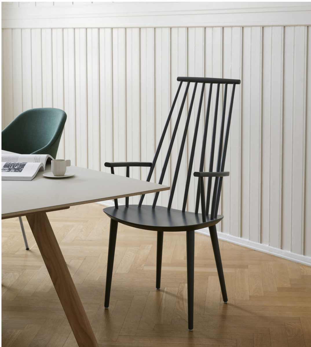
J110 Chair | Black water-based lacquered beech