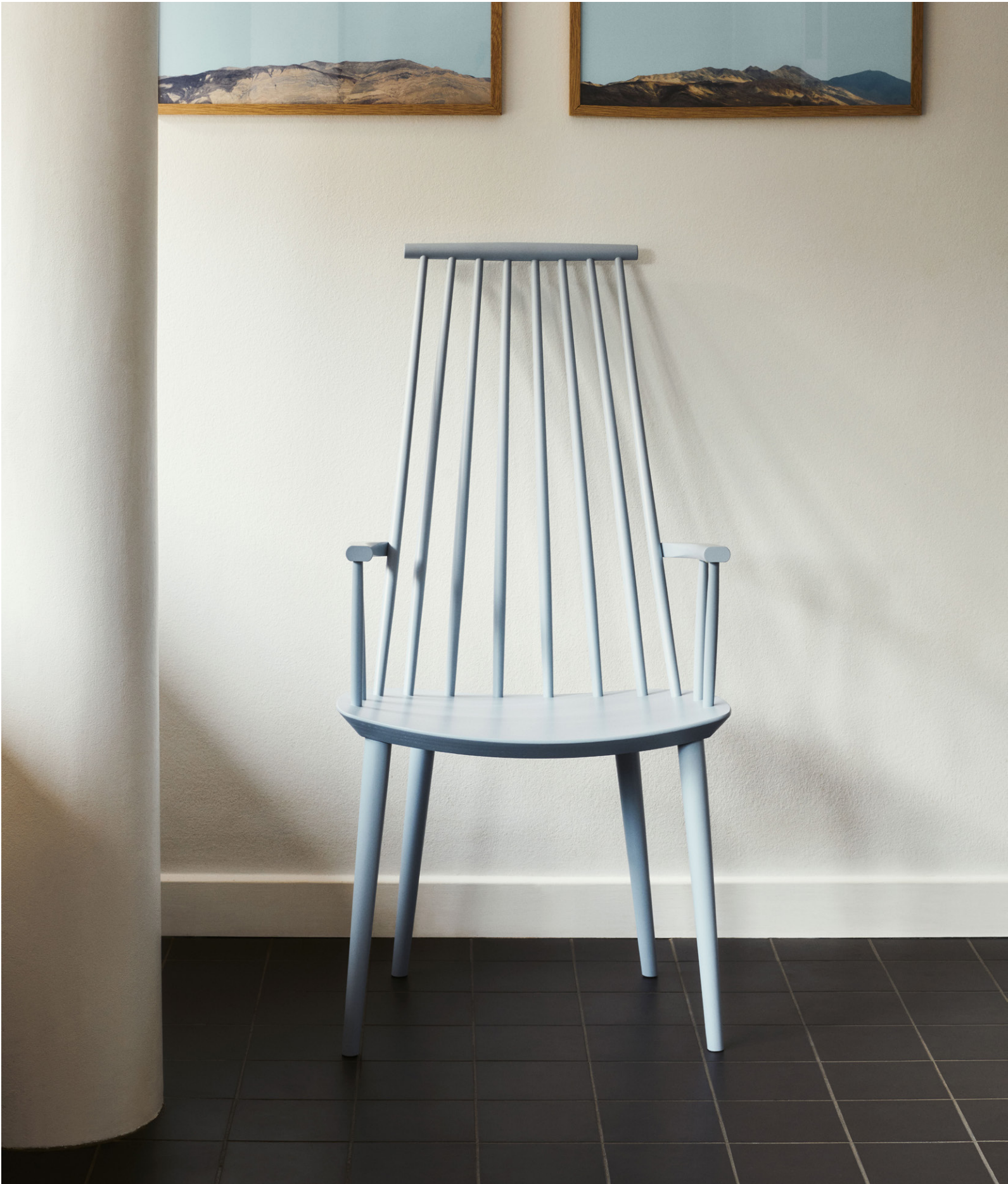
J110 Chair | Slate blue water-based lacquered beech