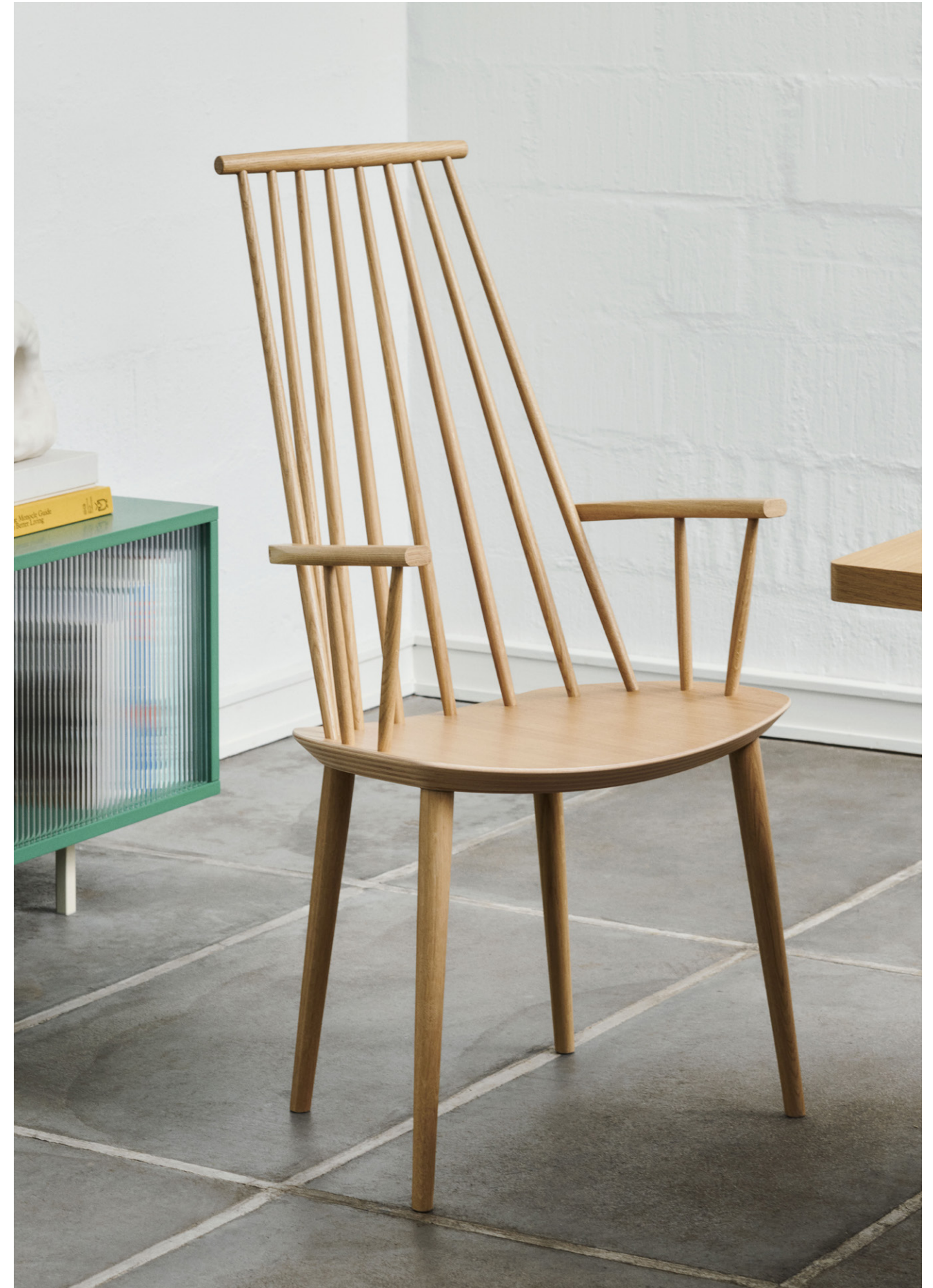
J110 Chair | Water-based lacquered oak