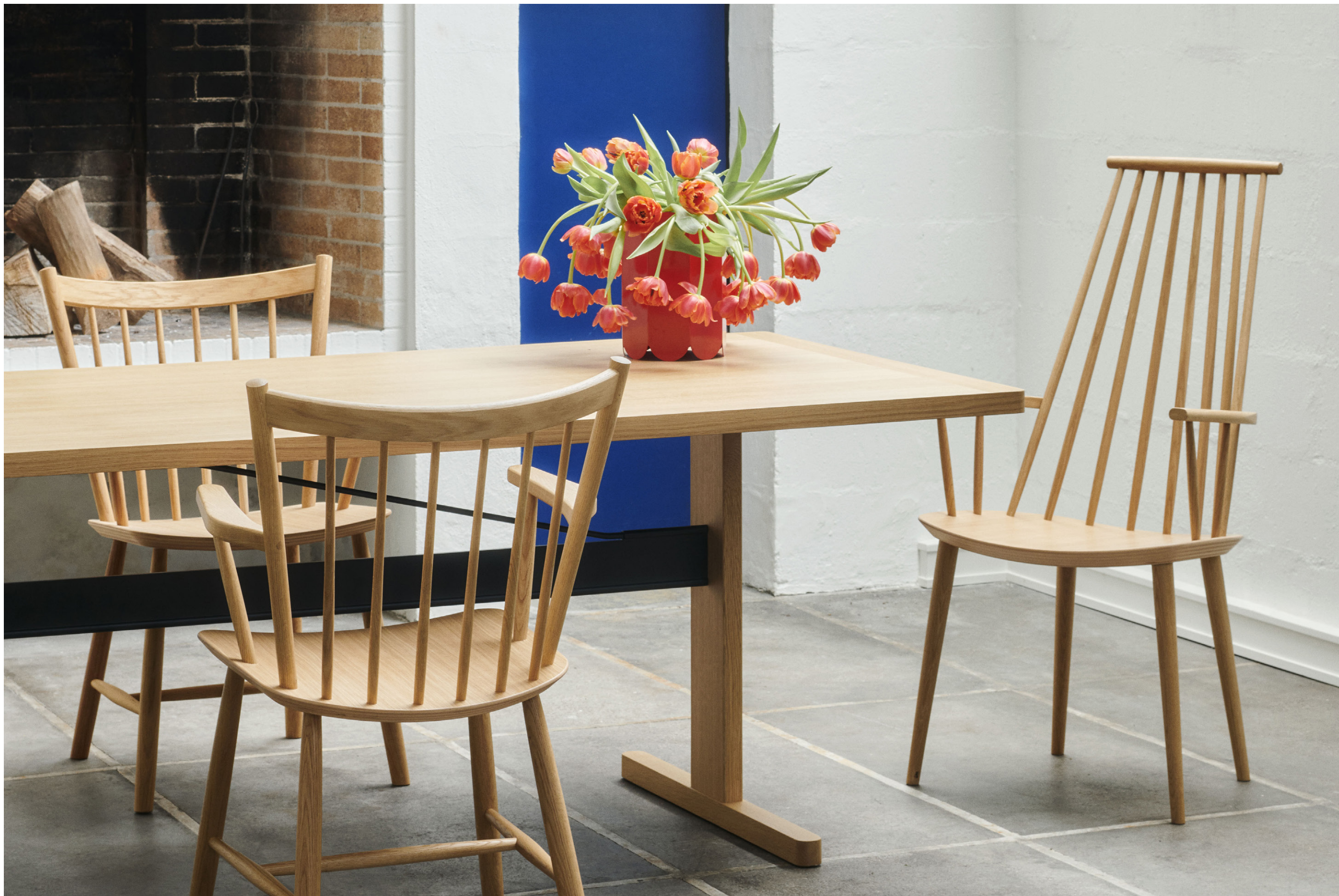
J110 Chair | Water-based lacquered oak