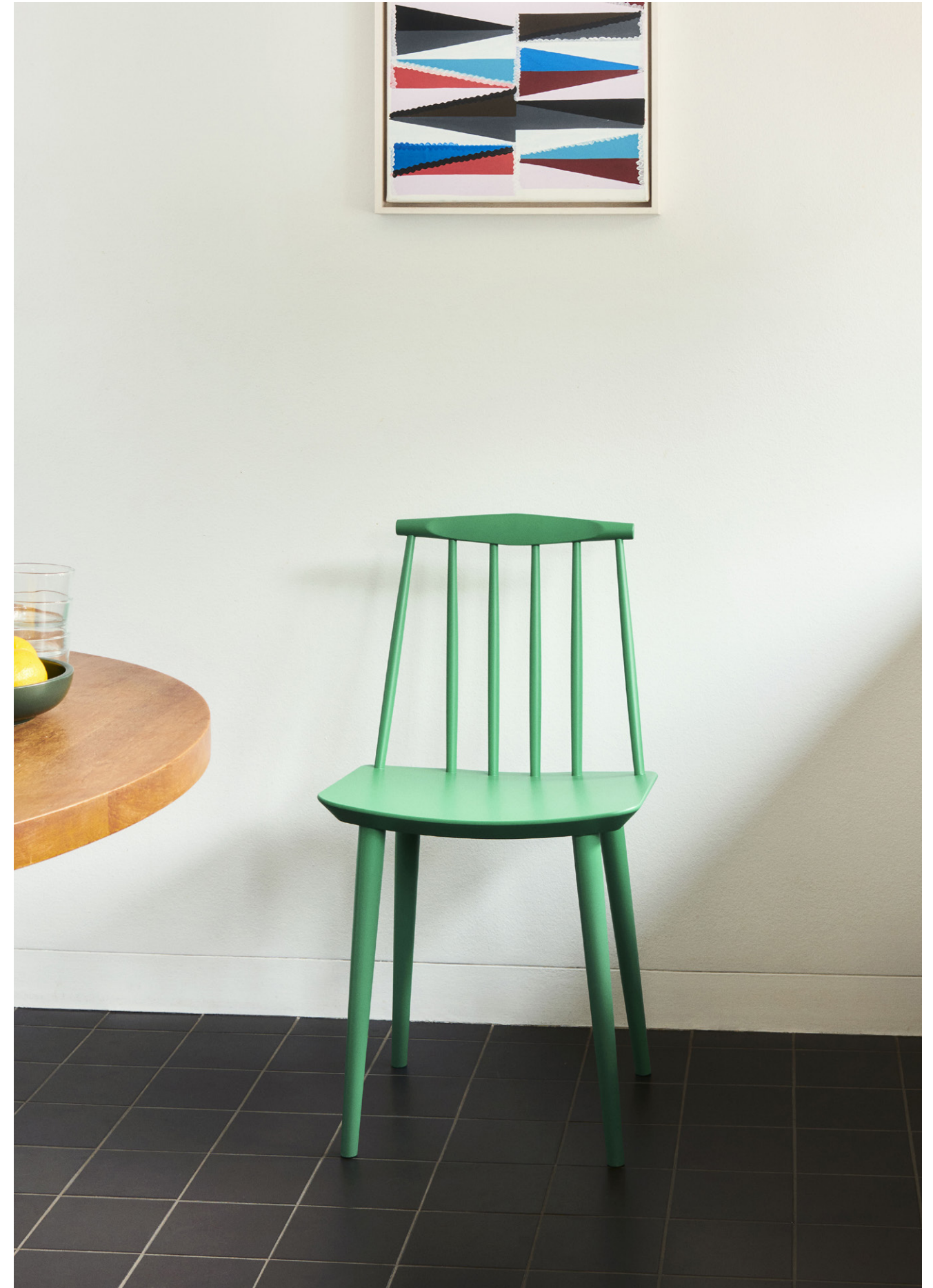
J77 Chair | Jade green water-based lacquered beech