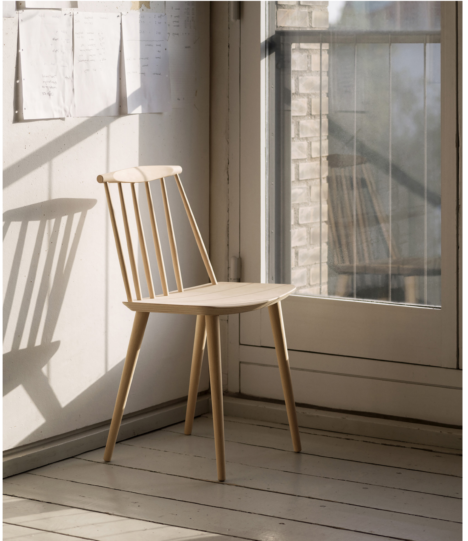
J77 Chair | Nature beech