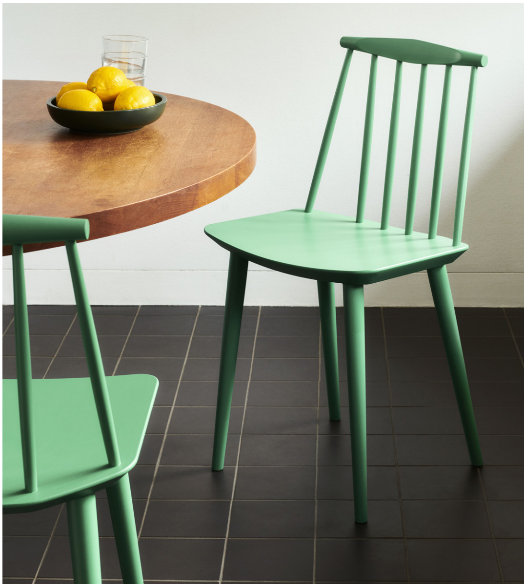
J77 Chair | Jade green water-based lacquered beech