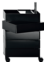
Glossy colour Black 1764 C