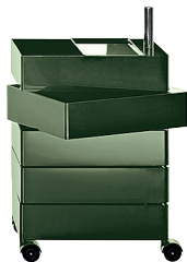
Glossy colour Olive Green 1551 C