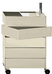
Glossy colour Light Grey 1707 C