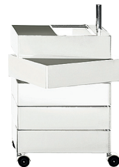
Glossy colour White 1673 C