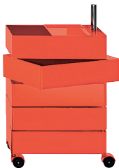
Glossy colour Red 1120 C