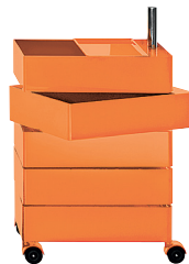
Glossy colour Orange 1658 C