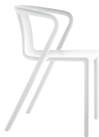
Matt colour Pure White 1690 C