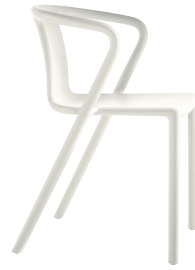
Matt colour White 1730 C