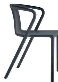
Matt colour Grey Anthracite 1418 C