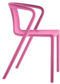
Matt colour Fuchsia 1150 C