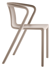
Matt colour Beige 1450 C