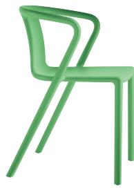
Matt colour Green 1320 C