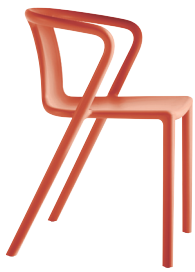
Matt colour Orange 1086 C