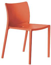
Matt colour Orange 1086 C