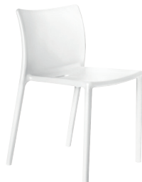
Matt colour Pure White 1690 C