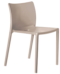
Matt colour Beige 1450 C