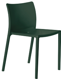
Matt colour Dark Green 1554 C