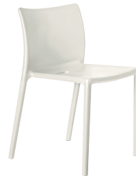
Matt colour White 1730 C