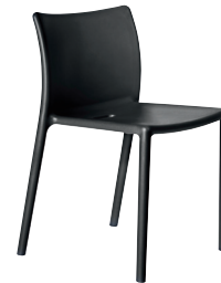
Matt colour Black 1751 C