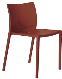
Matt colour Brick 1135 C