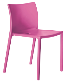
Matt colour Fuchsia 1150 C