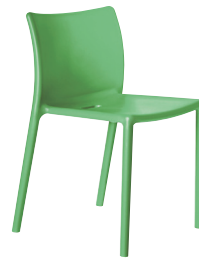
Matt colour Green 1320 C