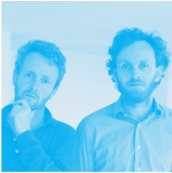
Ronan & Erwan Bouroullec

Ronan and Erwan Bouroullec have been working together for about ten years now. Their collaboration is a permanent dialogue, nourished by their distinct personalities and a shared notion of diligence, with the intention to achieve greater balance and refinement. The Bouroullecs have been working with Magis since 2004, designing two complete furniture collections as well as other projects. These days, Ronan and Erwan Bouroullec design for numerous manufacturers and they also continue to carry out their own experimental activity which is essential to the development of their work at Galerie Kreo, Paris, where four exhibitions of their designs