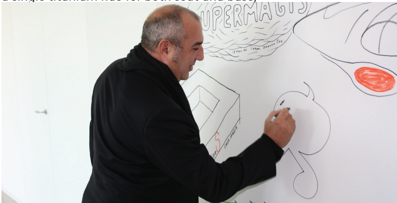
Designer in Magis

with an elegantly glamorous finish, is fitted with a gas piston to reach heights of up to 80 cm, making it even more practical and well-suited to the needs of the contract world, as well as domestic use. The base has also been fine-tuned to ensure perfect stability on any surface: Magis thinks of everything.