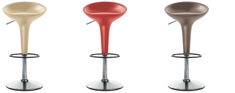
Matt colour Ivory 1020 C Adjustable height