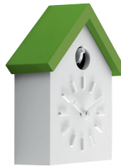
Matt colour Box and little bird: White 1735 C Roof: Green 1342 C