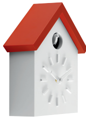
Matt colour Box and little bird: White 1735 C Roof: Orange 1086 C