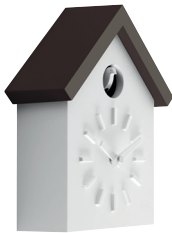
Matt colour Box and little bird: White 1735 C Roof: Brown 1070 C