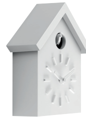
Matt colour Box and little bird: White 1735 C Roof: White 1735 C