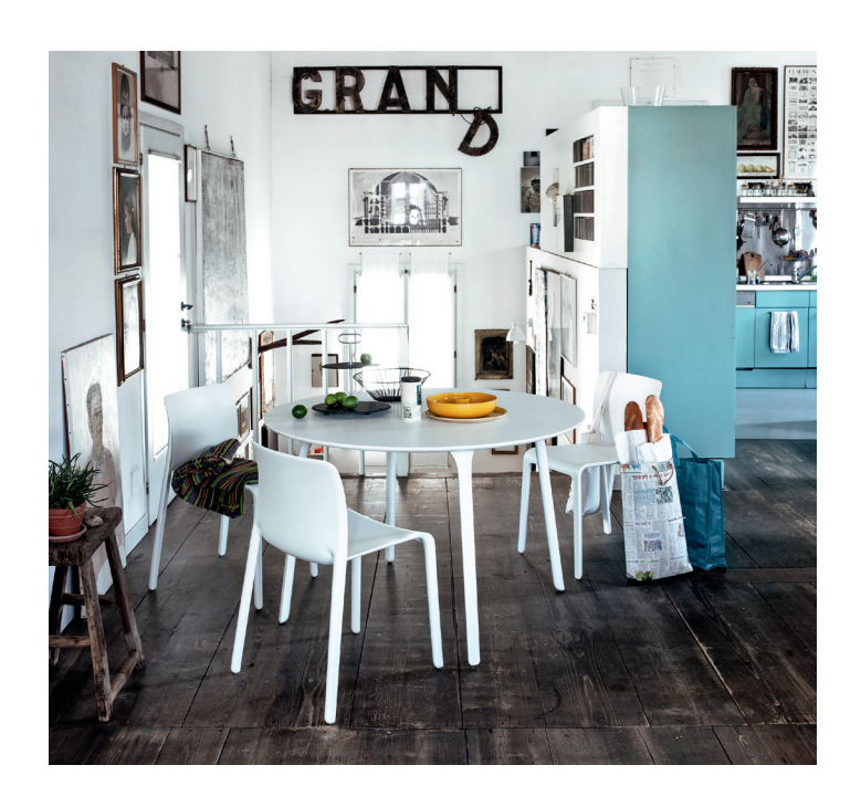
First — design Stefano Giovannoni, 2007