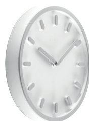
Matt colour Clock face: White 1735 C Hands, hour marks and frame: Grey 1737 C