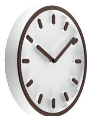
Matt colour Clock face: White 1735 C Hands, hour marks and frame: Brown 1070 C