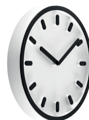
Matt colour Clock face: White 1735 C Hands, hour marks and frame: Black 1750 C