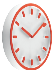
Matt colour Clock face: White 1735 C Hands, hour marks and frame: Orange 1086 C