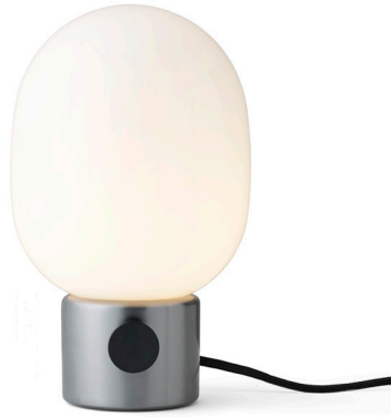
Brushed Steel 1800039