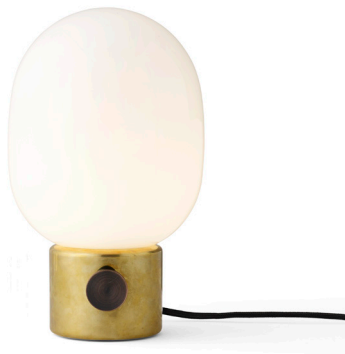
Mirror Polished Brass 1800839