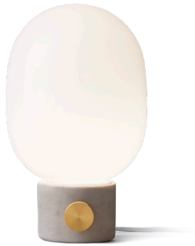
Light Grey/Brass 1800129