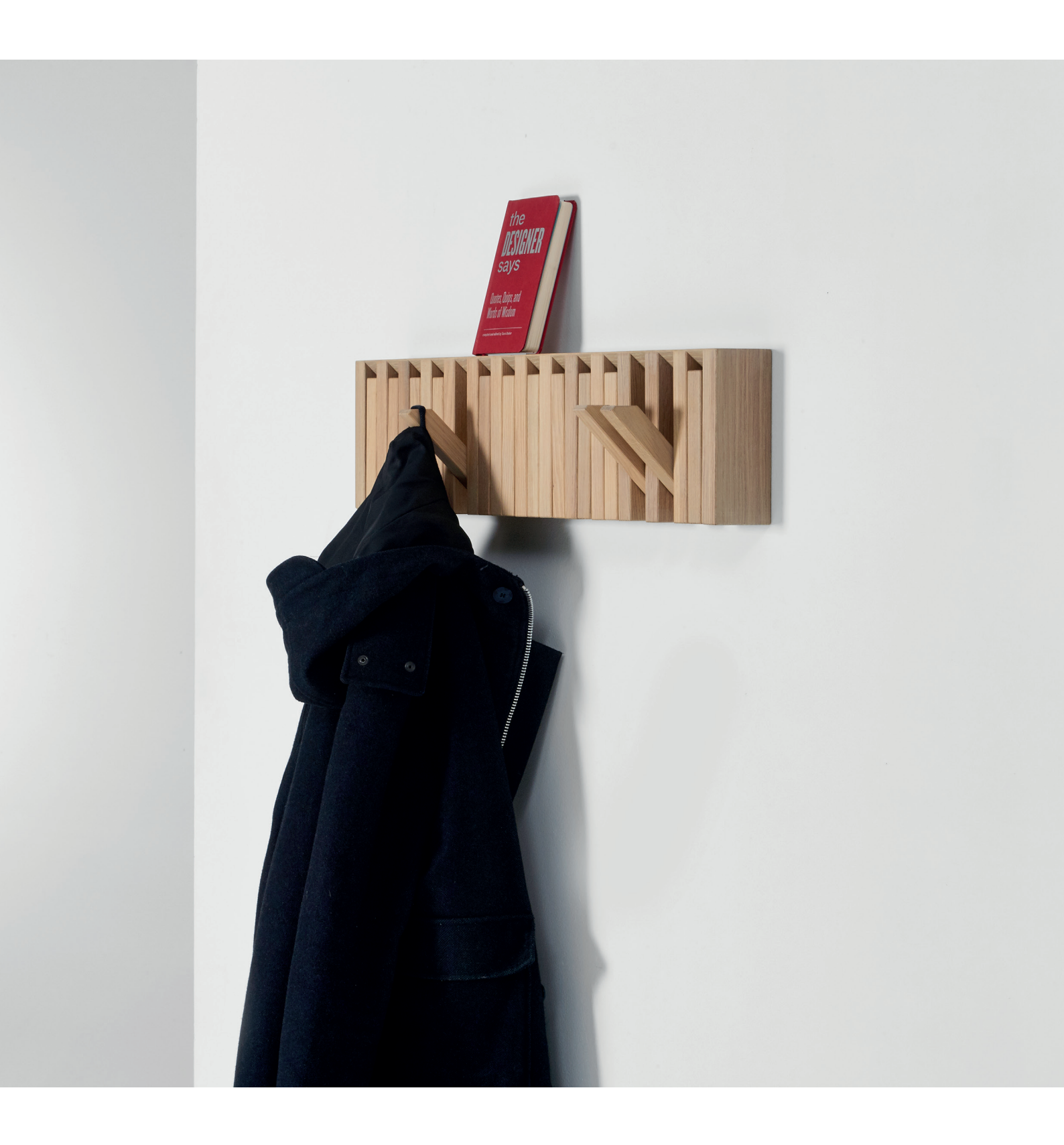
PIANO - XYLO COAT RACK / Patrick Séha