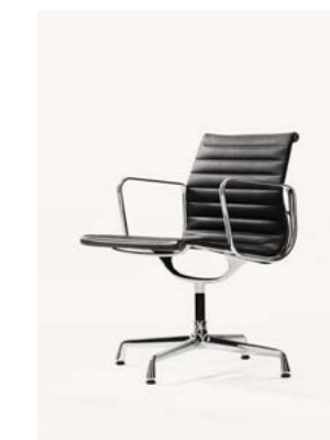
Eames Aluminium Group