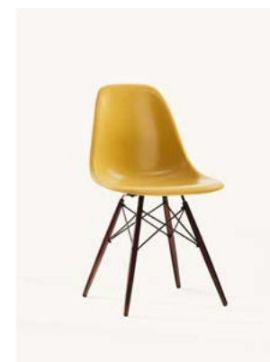
Eames Fiberglass Chair

Two new products have been added to the warranty programme in 2021: Tip Ton and Tip Ton RE by the British designers Edward Barber and Jay Osgerby. Both chairs are covered by a ten-year manufacturer's warranty following online registration of the products within three months after purchase.