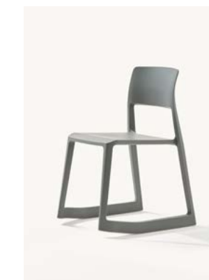
Tip Ton RE / Tip Ton