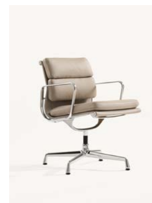
Eames Soft Pad Group