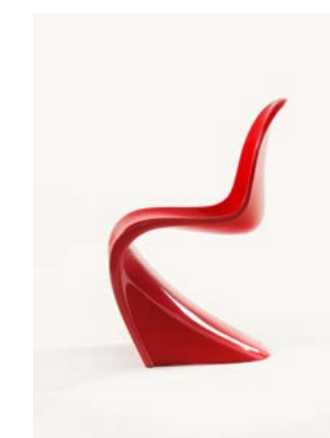
Panton Chair Classic