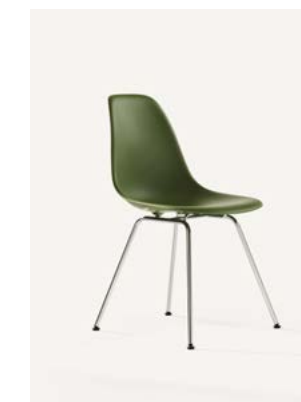
Eames Plastic Chair