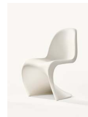
Panton Chair / Panton Junior