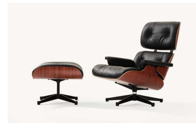
Lounge Chair & Ottoman